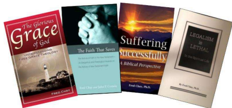
Grace Line Publications